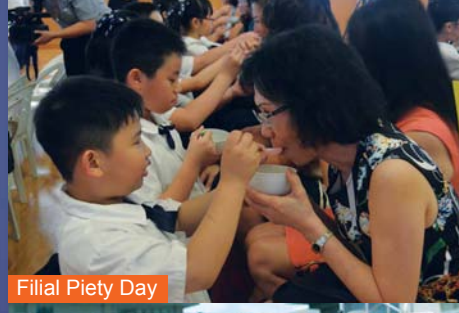
Filial Piety Day