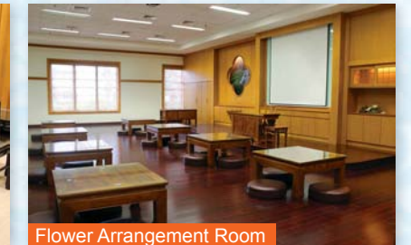
Flower Arrangement Room