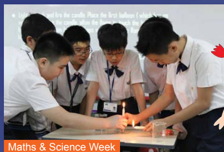
Maths & Science Week