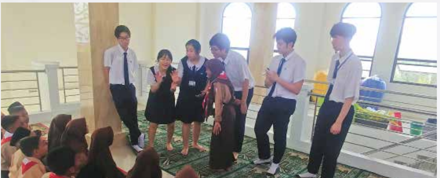
"Grade 12 Build a Library for Kamal Muara Village"