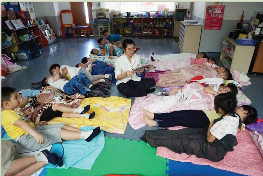
▲ Story telling before bed time