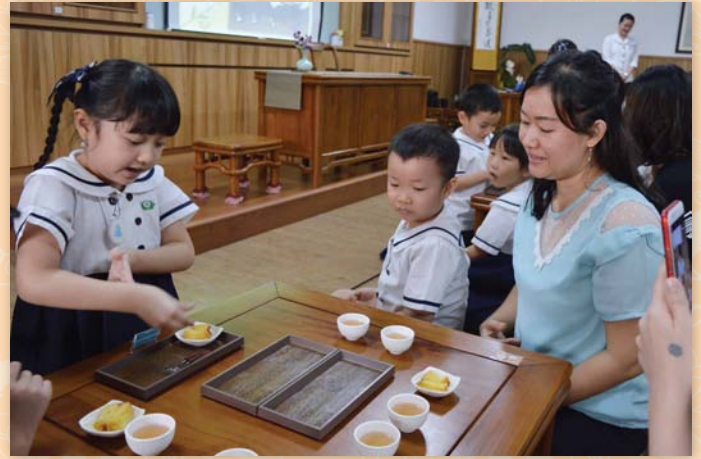
▲ Seorang siswi K2 menyajikan makanan ringan