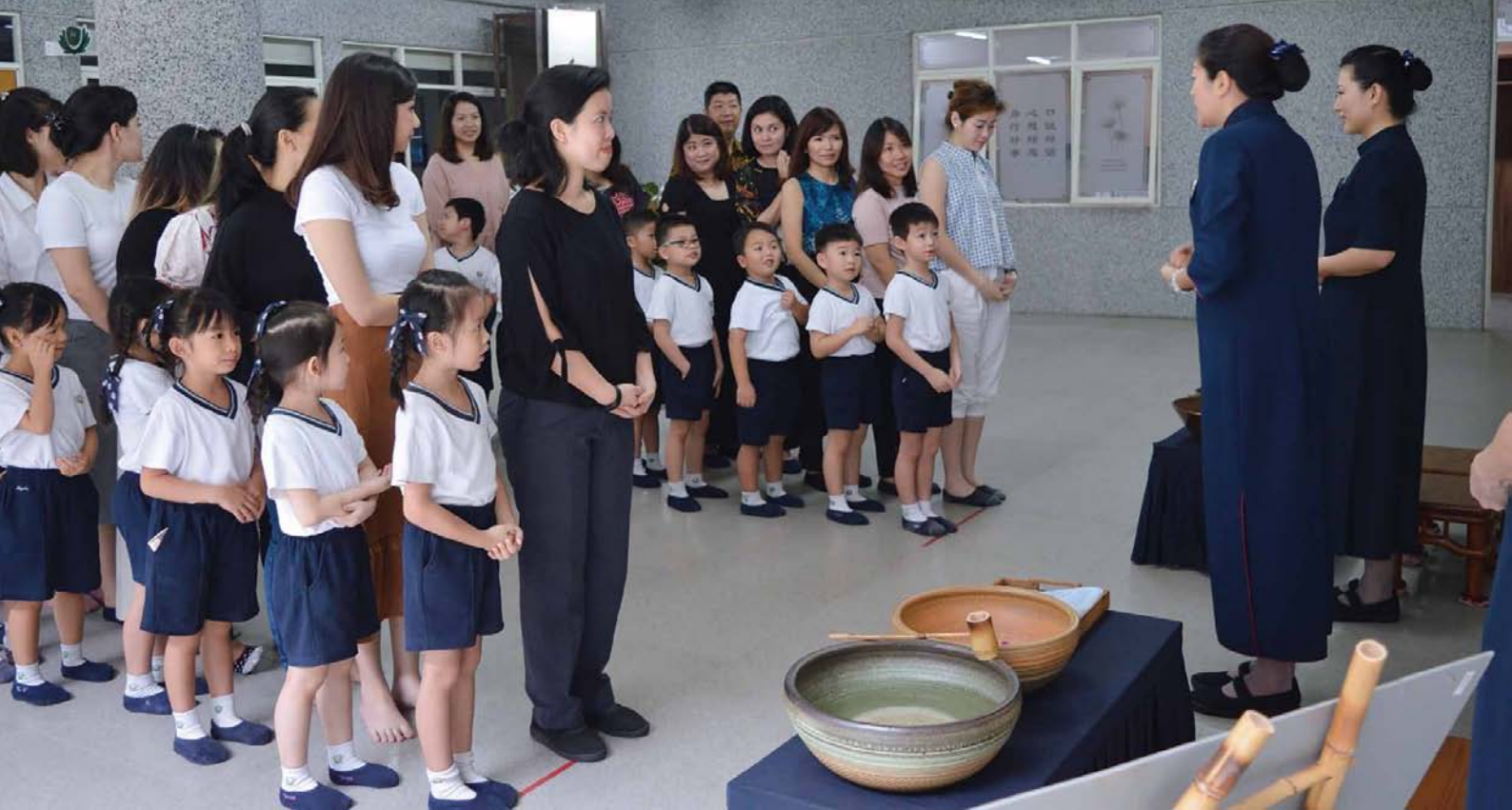
▲ Orangtua berbaris bersama dengan anak untuk mengikuti kelas