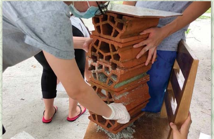
A third group working on reinforced concrete using sand and seashells; they made use of the chitin and calcium carbonate found in the seashells as soil fertilizer additive.

By all accounts they had an exciting time, honing their communication skills by collaborating with each other in small teams on aspects of biodiversity.