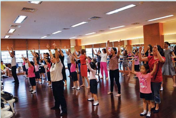
▲ Modern Dance EEP - Dancing with the parents

Through the EEP program, students were glad to be able to develop their love of music, sports, science and cooking that they did not find in their regular classes.