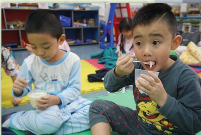
▲ Enjoying their snack after waking up from their nap