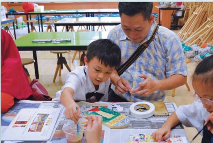
▲ A parent helping his child in making the background for his Manga drawing