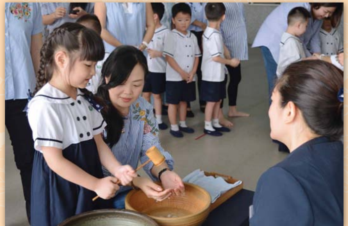
▲ Anak membantu mama membersihkan tangan

Master Cheng Yen sangat percaya bahwa ketika kita bisa berlaku tertib dalam perilaku kita, maka hal tersebut juga akan mempengaruhi diri kita. Maka mulai dari kelas seni minum teh N2, kami sudah mengajarkan anak-anak sikap saat berdiri, duduk dan berjalan. Kami berharap anak-anak dapat berlaku sopan, bergerak dengan anggun, dan terlebih dapat menunjukkan sopan santun saat bertamu atau menjadi tuan rumah.