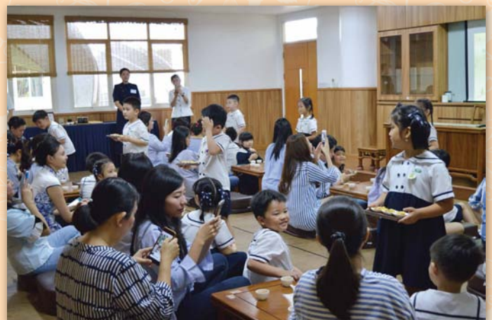
▲ Anak-anak K2 mempersembahkan teh