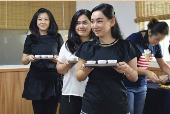
▲ Orangtua juga bersemangat dalam menyajikan teh