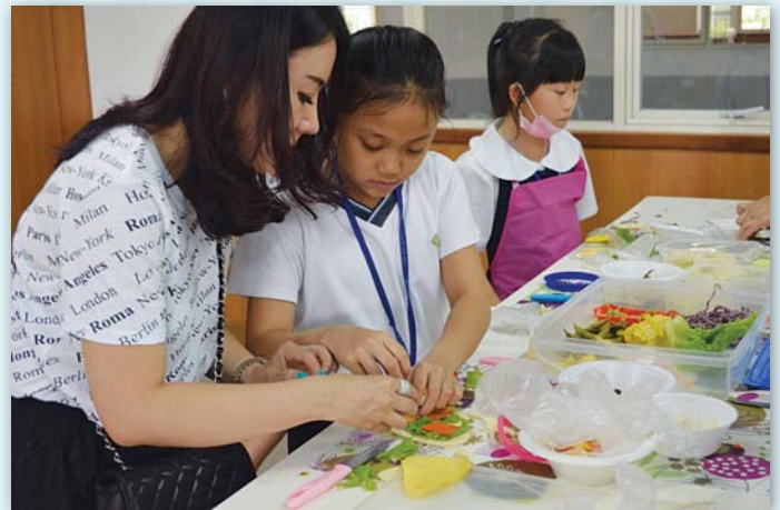
▲ Cooking activity with parents in Cooking Club