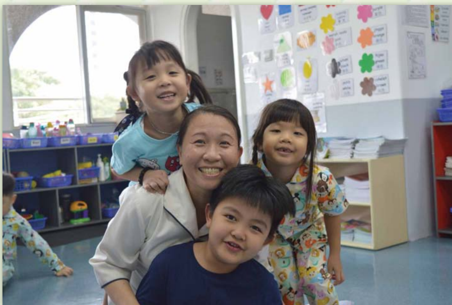
▲ Fun time together