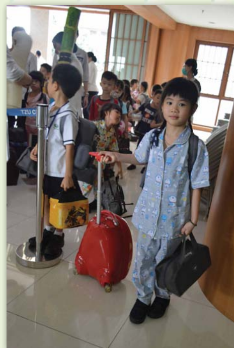
▶ Getting ready to go home