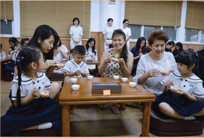
▲ Orangtua dan anak-anak bersama-sama menikmati teh dengan hikmat