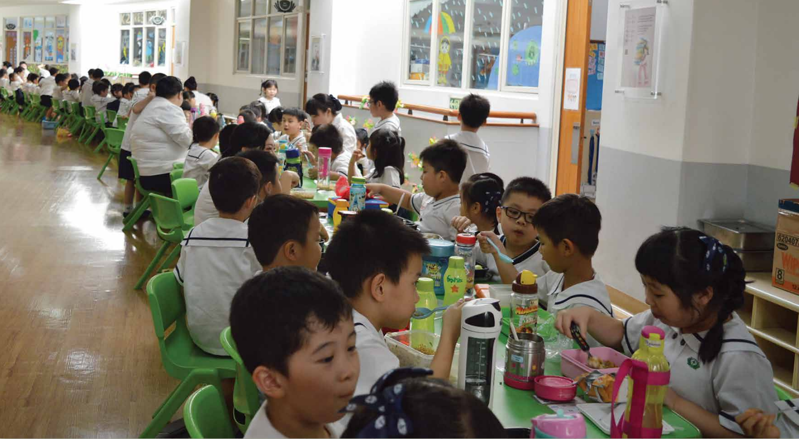
▲ Enjoying their lunch together with friends and teachers