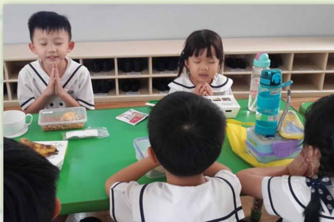
▶ Praying before eating

We could see from their faces that they really enjoyed the activities. All went home with a big smile and hopefully a wonderful memory to share for years to come.