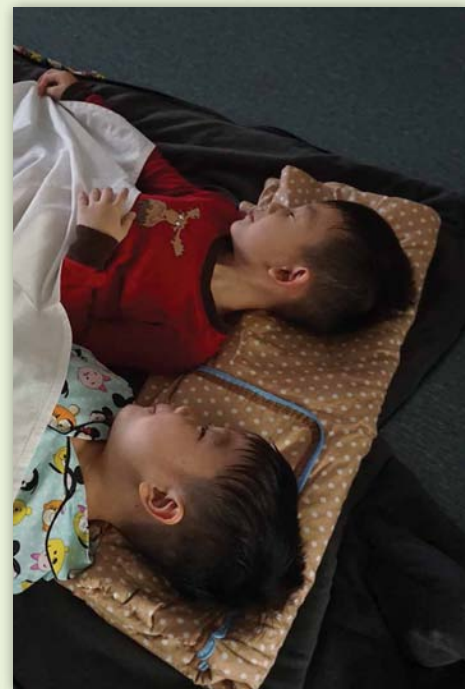
▶ Nap time