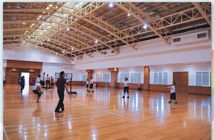
▲ Badminton EEP – Child vs Parent