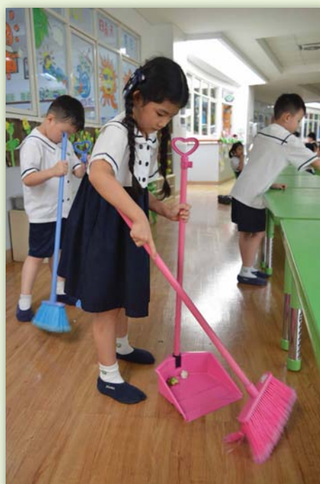
▲ Cleaning up after lunch