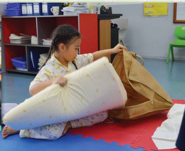
▲ Packing up their own sleeping bag