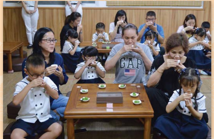
▲ Menikmati teh dalam kebersamaan