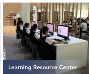
Learning Resource Center