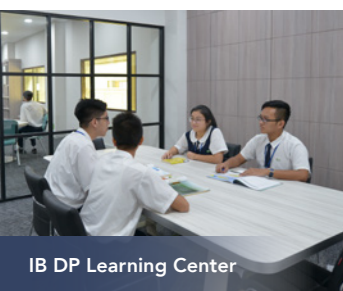
IB DP Learning Center