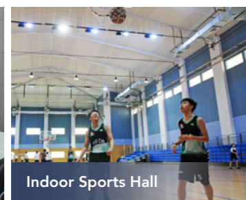
Indoor Sports Hall