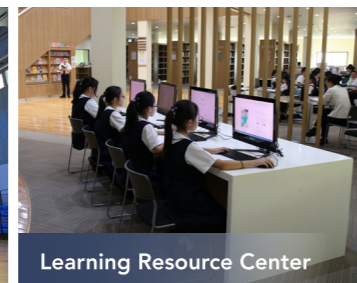
Learning Resource Center