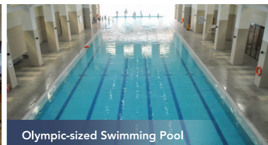
Olympic-sized Swimming Pool