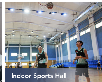
Indoor Sports Hall