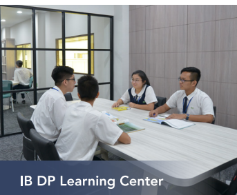
IB DP Learning Center