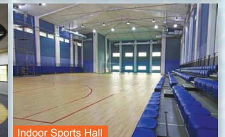
Indoor Sports Hall