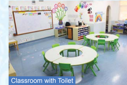
Classroom with Toilet