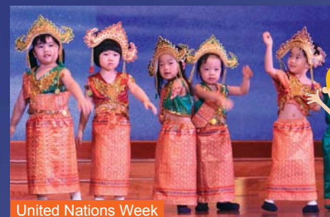
United Nations Week